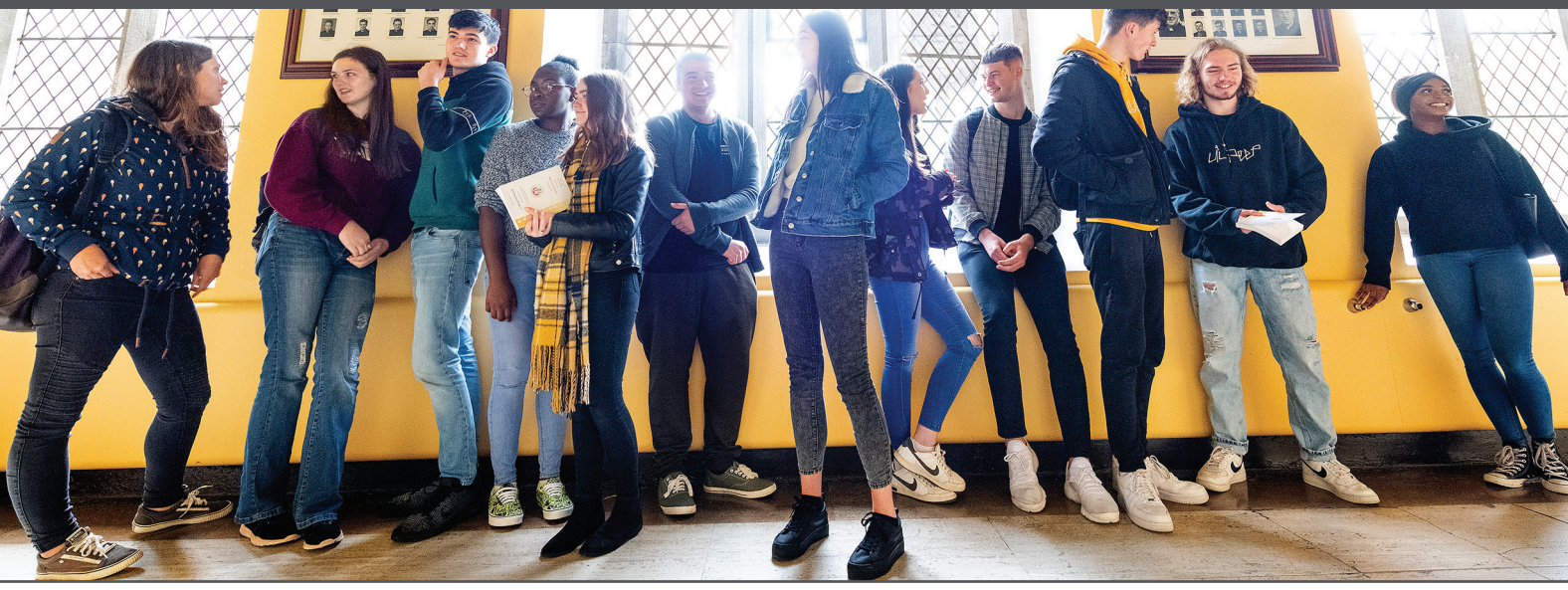
BA Theology Class of 2019 - Making new friends during Orientation Week