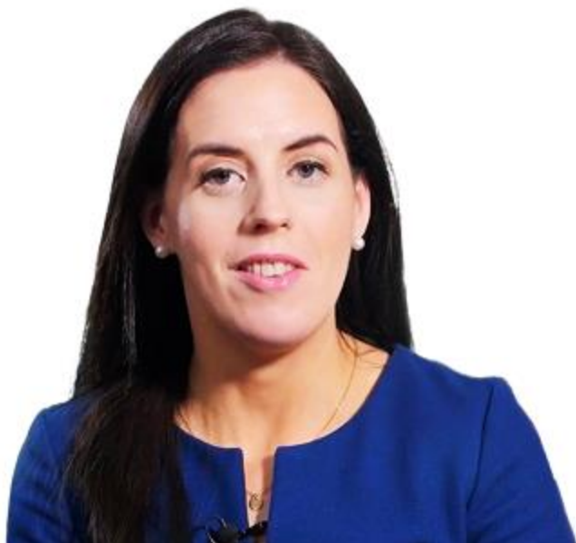
Sinéad Hussey Correspondent, RTÉ