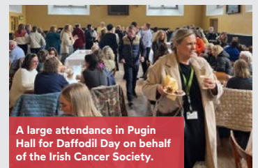
A large attendance in Pugin Hall for Daffodil Day on behalf of the Irish Cancer Society.