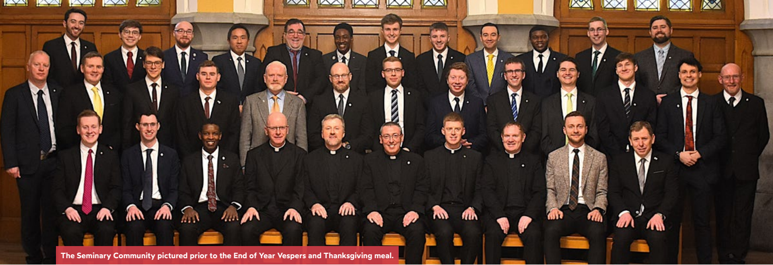
The Seminary Community pictured prior to the End of Year Vespers and Thanksgiving meal.